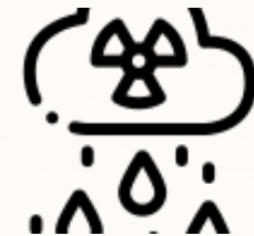
Our air, water, and home are threatened

The Green New Deal includes investments not only in communities and public infrastructure but also in private industry to enable a sweeping transformation of our entire economy - with the public receiving appropriate ownership stakes and returns on its investments