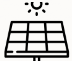
Solutions are ready to go and they'll make our lives better.

THE PLAN CALLS AND ENABLES OUR WHOLE SOCIETY TO PARTICIPATE IN A SINGLE GREAT NATIONAL AIM: THE RAPID TRANSITION TO A FORWARD-LOOKING SOCIETY OF BROAD OPPORTUNITY, EQUAL JUSTICE, PRODUCTIVE PROSPERITY, AND ENVIRONMENTAL SUSTAINABILITY.