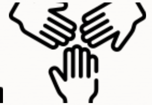
We will not be divided